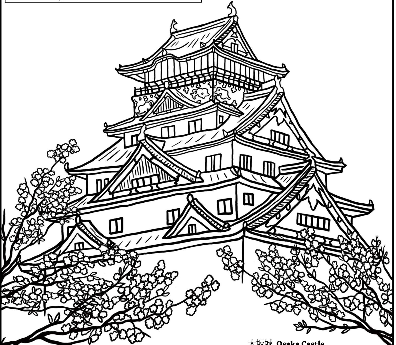
大坂城 Osaka Castle

The original castle was built in 1583, the largest in Japan at the time. It was the site of major battles – even destroyed by fire then reconstructed. Lightning burned down the main tower in 1665, not to be rebuilt until 1931.